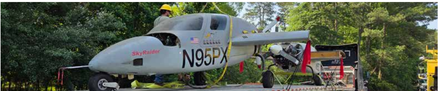
The donation of $1.8 million in Uncrewed Aircraft Systems (UAS) equipment will help ESCC expand its UAS programs and support business, research and government opportunities on the Eastern Shore.

Eastern Shore Community College is charting a bold path forward. With record enrollments, expanding workforce programs, and transformative gifts supporting initiatives like Engineering and Uncrewed Aircraft Systems, the future of ESCC has never been brighter. Our donors and regional partners are investing not just in programs, but in people, expanding opportunities for students to learn, earn, and stay on the Shore. Together, we are building pathways that empower today's learners and strengthen our region.