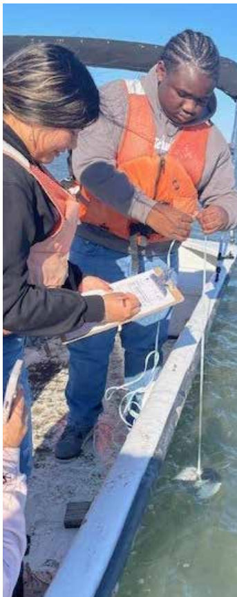
PH Students use a Secchi disc to measure water turbidity

This fall, Project Horizons/Discovery students embarked on inspiring college tours to Virginia Wesleyan University, William & Mary, and ESCC's Back to School Bash, gaining firsthand insight into campus life and academic opportunities. A hands-on field trip to UVA's Coastal Research Center in October further enriched their experience, sparking interest in careers in coastal ecology and environmental science.