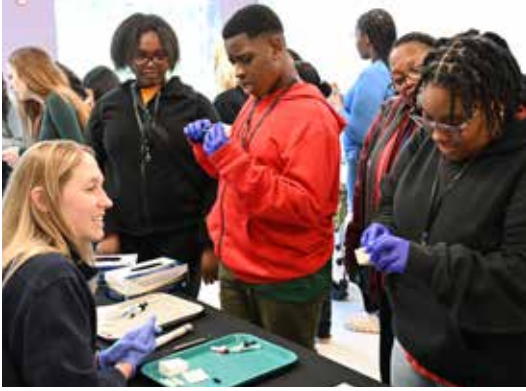
Students explore careers in healthcare with Riverside Shore Memorial Hospital.