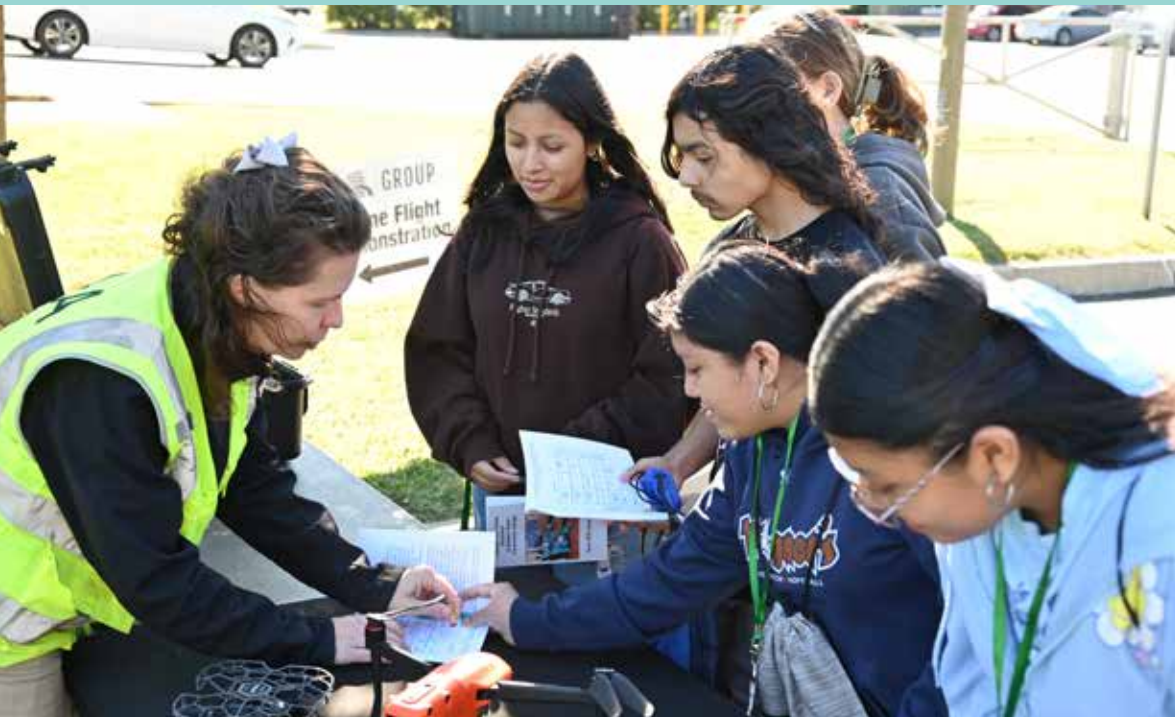
Local 10th graders explore careers that use drone technology with Sentinel Robotic Solutions at Career Day.