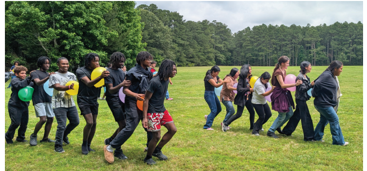
PH/D students enjoyed team building and hands-on outdoor activities at Camp Occohannock

The program is funded through generous donations to ESCC Foundation and operated in partnership with a grant from Project Discovery of Virginia.