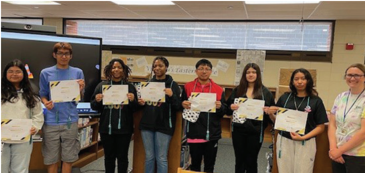
Northampton High School Project Horizons/Discovery seniors received year-end awards