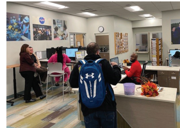
ESCC's Student Services team practices our YES! culture of hospitality, accountability, transparency and inclusion to help students plan their course of study, register and apply for financial aid.

In October, ESCC met with our Achieving the Dream Coaches to begin implementing the initiative on our Melfa campus. Our plan is to utilize ATD's past success with other rural colleges to greater assist our students in meeting their educational goals. ATD's work aligns closely with ESCC's goal to be the national model for a rural-serving institution of higher learning.