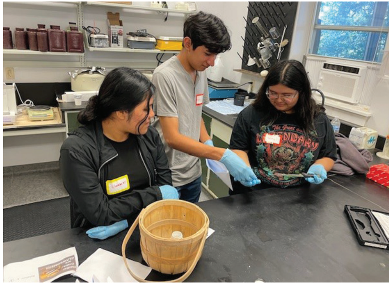
Project Horizons/Discovery 12th graders measure and weigh fiddler crabs at UVA's Coastal Research Center