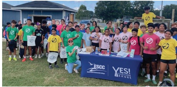
Shore Soccer League players at Randy Custis Memorial Park

I am pleased to announce that ESCC is launching men's and women's soccer teams. Building on the success of our Shore high school, club and recreational teams, ESCC Soccer will integrate student athletes into our school environment which should boost their academic performance and outcomes. Student athletes will experience a higher level of competition as well as honing their skills, all while attaining their associate