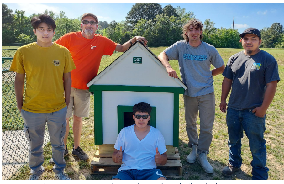
NCCER Core Construction Trades students built a doghouse as a class project and donated it to the Eastern Shore SPCA

As I begin my second year at ESCC, I am excited for our future, and I hope that you will consider ESCC as part of your YES!