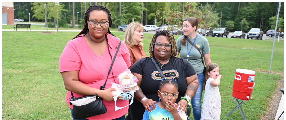
Students, Alumni and families enjoy gathering on campus.