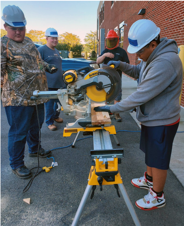
NCCER Core Construction Class

ESCC is a community college in every way. Our doors are open to all. Whether you want to enter the workforce as quickly as possible, transfer to a four-year university, take college dual enrollment classes while in high school, earn your GED, up-skill in specific areas, gain a career studies certificate, earn a stackable certificate, earn a credential, or you want to become proficient in English, ESCC is the school for you!