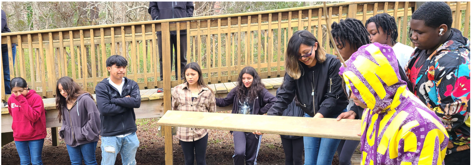
Project Horizons students practice leadership skills through hands-on activities