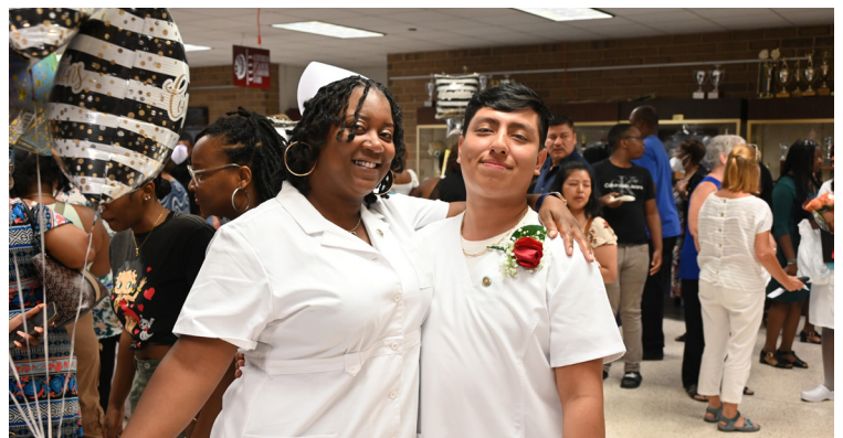
LPN graduates celebrate their accomplishments.